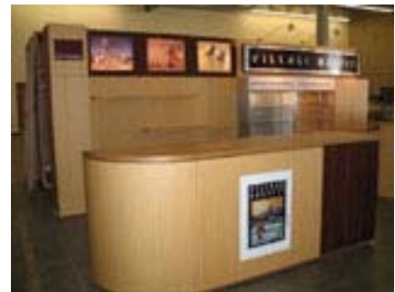
New freezer-equipped booth